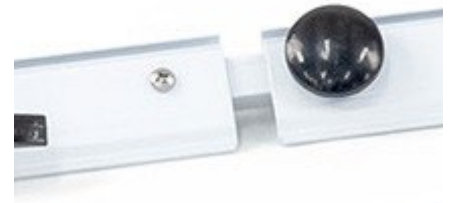
Fig. 7: AFK Slide Sections