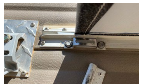
Fig. 4: Wall Bracket Positions