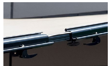
Fig. 8: Fabric clamped in the AFKPRO +