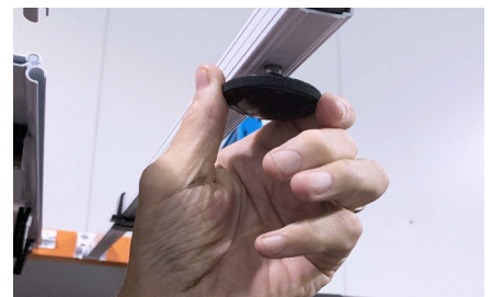
Fig. 2: Knurled Knob on Right Hand Rafter Arm