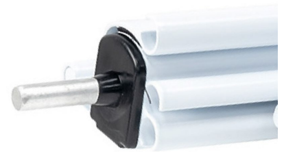
Fig. 6: Spigot End