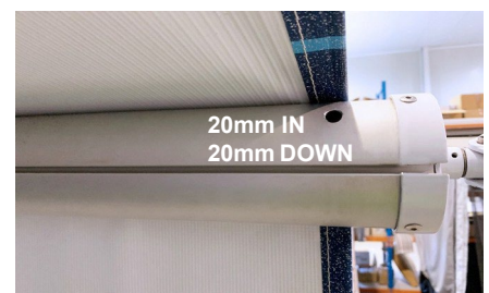
Fig. 3: Drill Hole Position