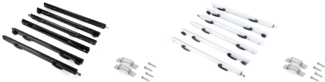
ANTI-FLAP KIT PRO+ – BLACK PART NUMBER: 24000000000080