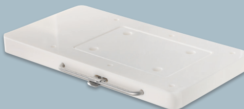
WATERSNAKE NYLON QUICK RELEASE BRACKET