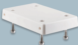
WATERSNAKE NYLON QUICK RELEASE PUCK PLATE KIT