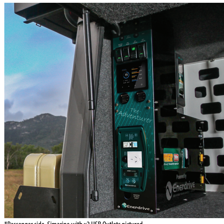
*Passenger side, Simarine with x2 USB Outlets pictured